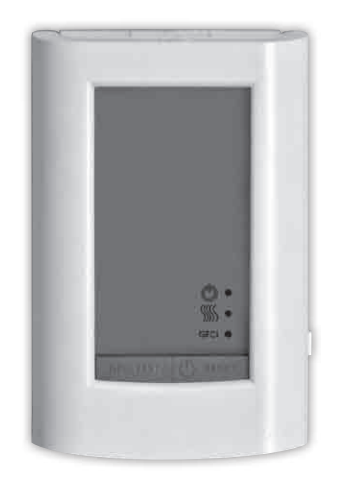
SunStat Relay II

This Engineering Sheet is not intended to provide full installation instructions and safety information. In order to avoid property damage or injury, please refer to the complete installation manual and product safety information provided with the product.