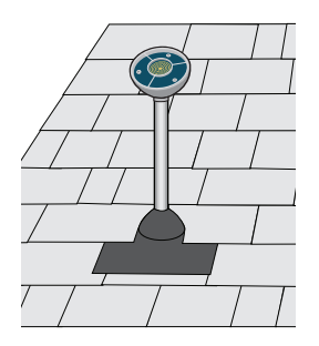
Roof Mounted Ensure water-proof installation with flashing boot or similar method

The sensor should be installed outside on a nominal 1/2" (16 mm) PVC or rigid metal conduit pole either on a roof or to the side of the snow melting surface. The sensor must be located away from trees, building overhangs or other locations that may interfere with falling snow. Avoid installing in locations where the sensor may be vandalized. It is best to point the front face of the sensor in the direction of any prevailing wind.