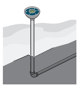
Ground Mounted Conduit run underground with a pole above surface