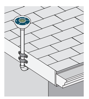
Roof Mounted Conduit fastened to fascia board